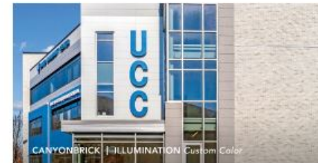
CANYONBRICK | ILLUMINATION Custom Color